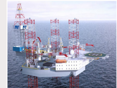
August - October 2022 Drilling Activities