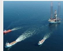
August 2022 Rig Mobilisation