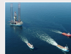
December 2022 Rig Demobilisation